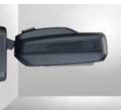
Locking Mount Bracket